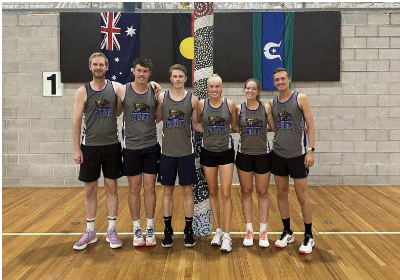
Pictured: 2023 squad and team captains.